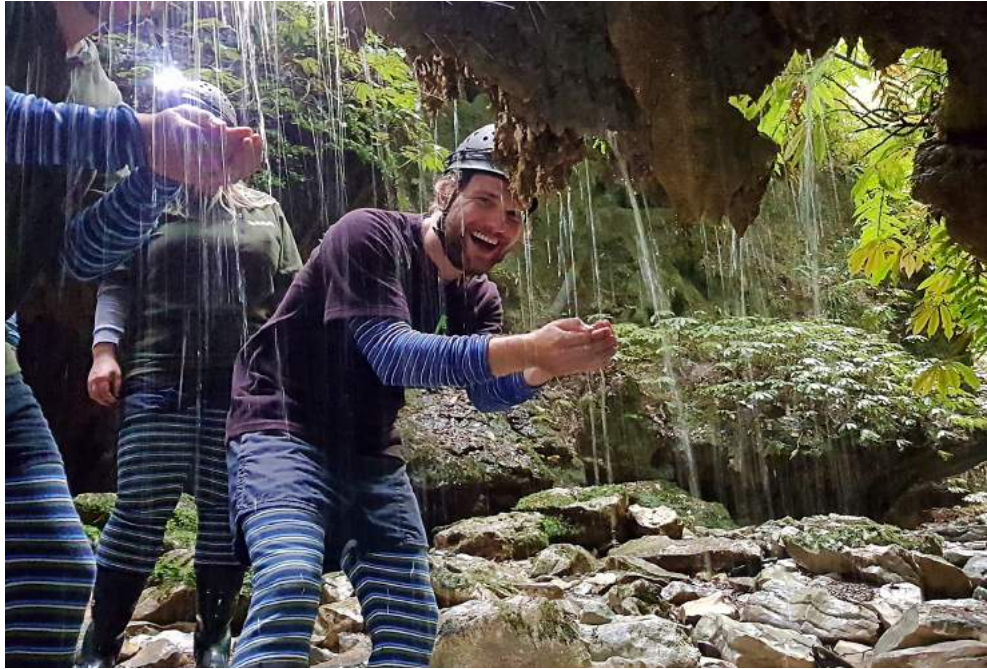
Down to Earth Waitomo - Intimate, Private Glow Worm Cave Eco Tours - 3hrs

We are a family in Waitomo that just happens to have an AMAZING world-class glow worm cave system right under our family farm! We offer 3 different tours in a relaxed and adventurous experience.