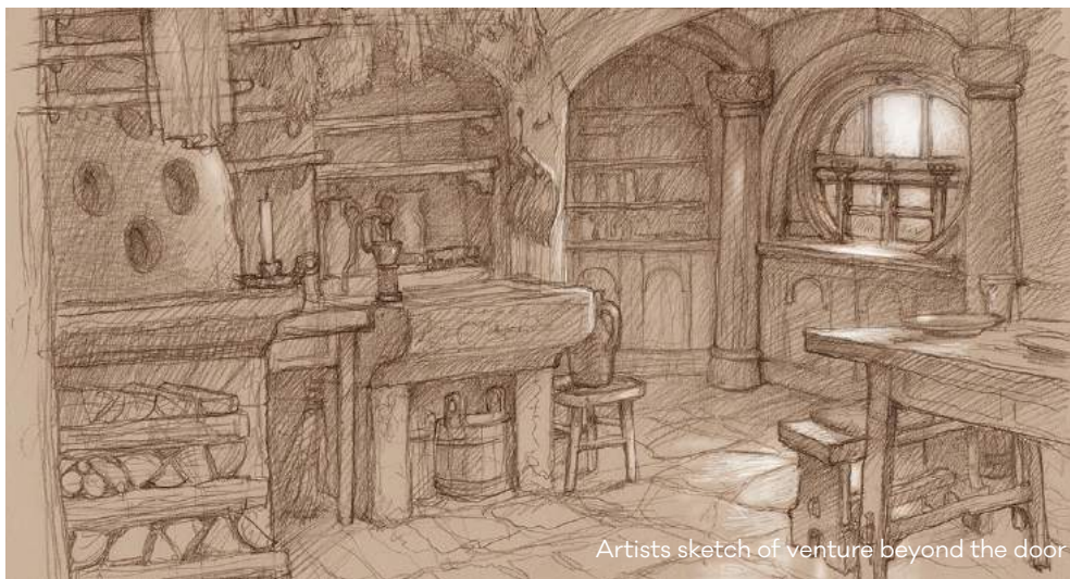
Artists sketch of venture beyond the door