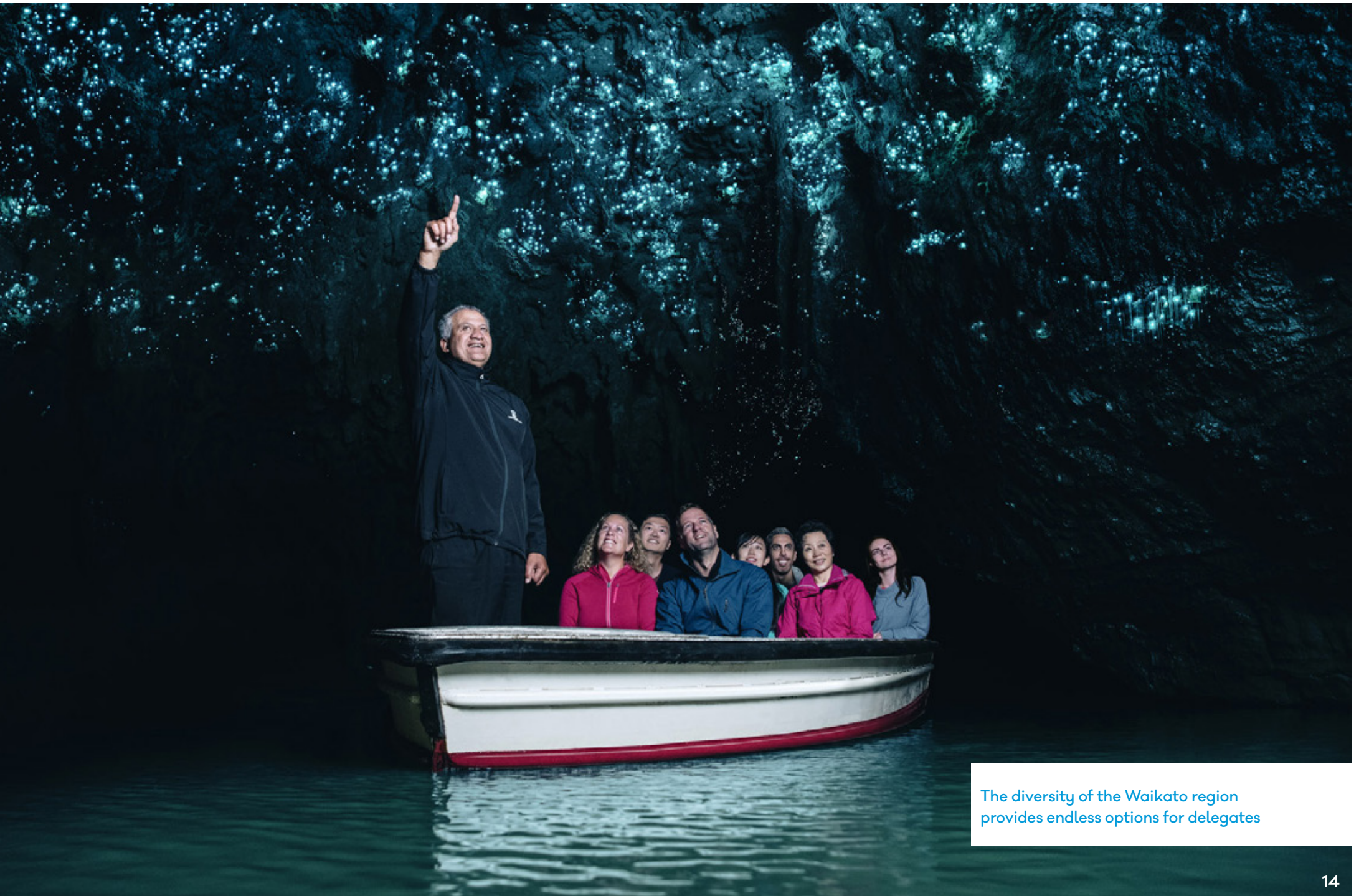
The diversity of the Waikato region provides endless options for delegates